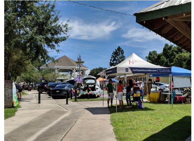
2018 Abita Springs National Electric Drive Week Event - September 9th, 2018 at the Abita Springs Trailhead Park.