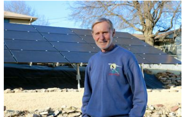
Don Preister Councilman for the City of Bellevue, NE